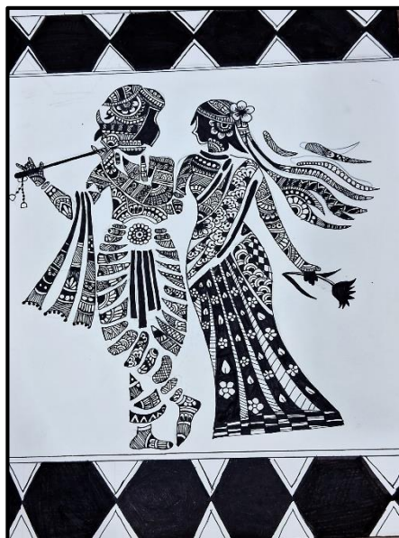
~ AVISHI AGARWAL (VII C)