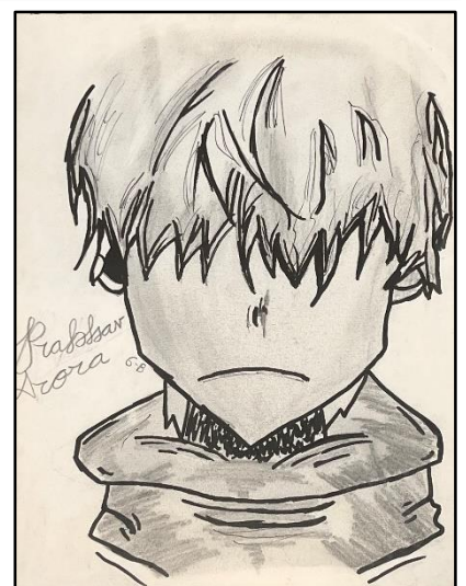
~ PRABHAV ARORA (VI B)