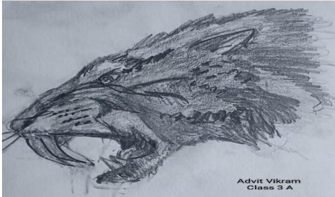
Advit Vikram Class 3 A