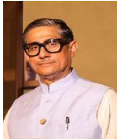
WE ALWAYS NEED YOUR BLESSINGS!