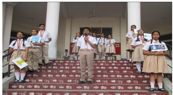
Theme- “Safe Browsing”