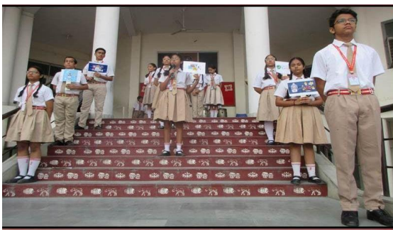
Theme- “Safe Browsing”

“The Internet Is A Tool, But It’s Up To Us To Use It Safely And Wisely.”