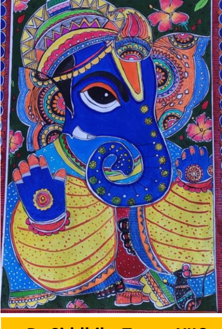
By Siddhika Tomar XIIC