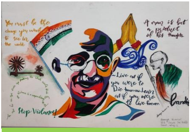
By Aranya Kumari VIB