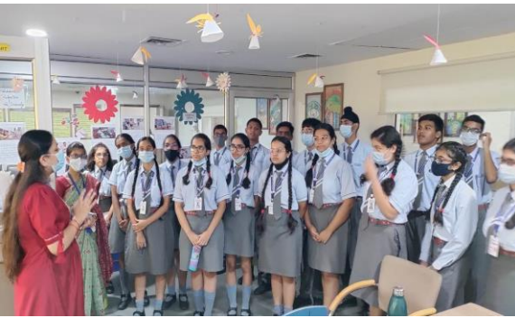
Visit to C.L. Gupta Eye Hospital