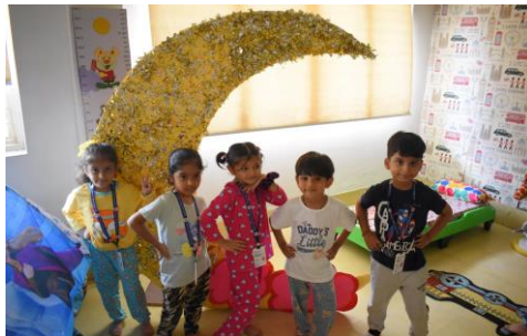
Kinder Garten Pajama Party