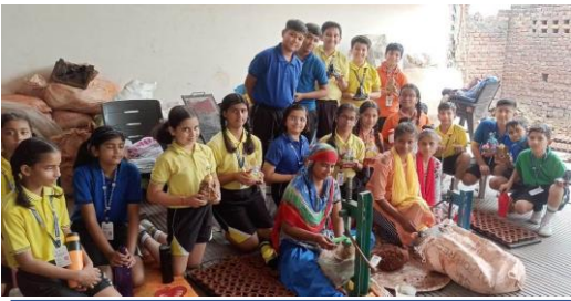
Visit to Gaushala