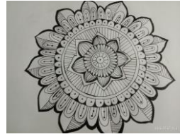
Aura Agarwal VII B Wing 2