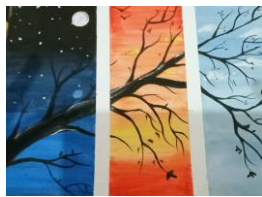
Saanvi Chabra VIIC Wing 2