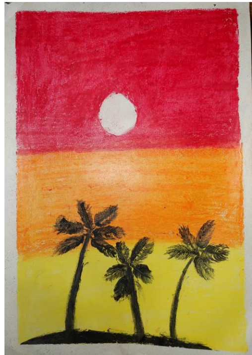
Bibhuti Agarwal VIA Wing 1