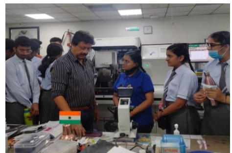
Visit to Ultimate Pathology Lab